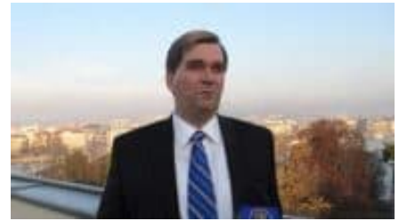
China's Desperate Attempts to Hide the Genocide that Drives its Transplant Industry