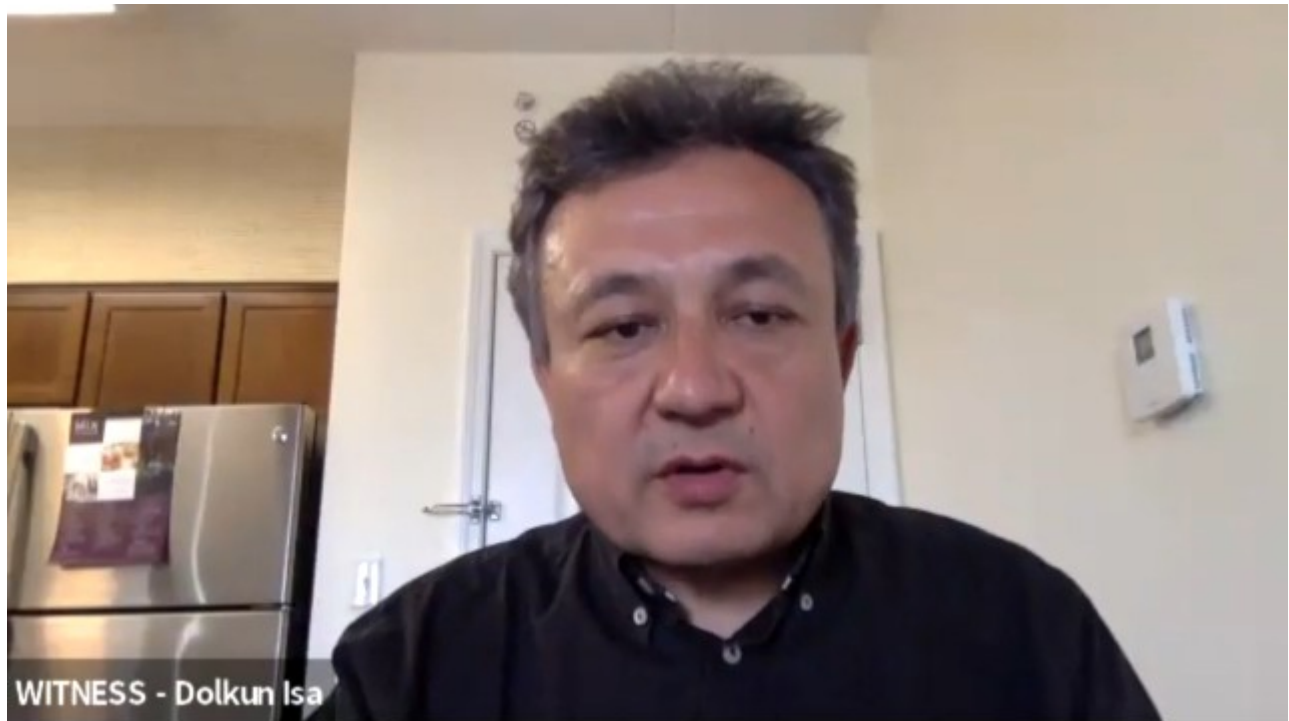
Dolkun Isa, President of the Munich-based World Uyghur Congress.

Dolkun Isa, President of the Munich-based World Uyghur Congress , spoke of his deep concern at the deteriorating situation for Uyghurs in China. Together with mass disappearances, arrests, and incarcerations, he feared for the eradication of the Uyghur identity. Based on evidence primarily from 2000 Kazakhs released from re-education after an agreement between Beijing and Kazakhstan, it is clear, he concluded, that inmates are subjected not only to torture and abuse, but systematic health checks, including blood, DNA, and organ scanning.