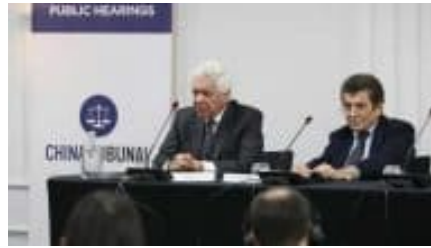
Organ Harvesting Tribunal Finds Overwhelmingly Against China