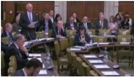
UK Parliament Debates Forced Live Organ Extraction in China