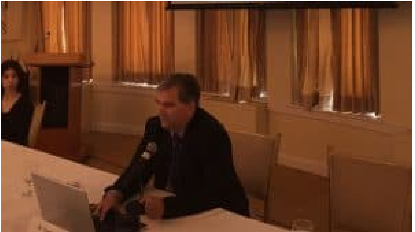
Forced Organ Harvesting in China Denounced in Washington DC