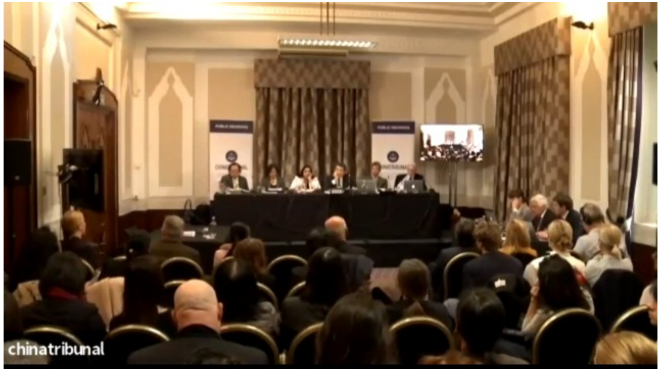
China Tribunal in London. April 2019 hearings.

willfully ignorant of the facts – Patients alive at the time of harvesting – Uyghurs dismay at the deteriorating situation in Xinjiang